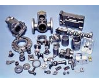
Cast parts for industrial machinery